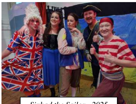
Sinbad the Sailor - 2025

You may think I'm crazy but after the success of last years panto we have managed to book the Laugh Out Loud Theatre Company for their Production of The Sleeping Beauty on 29/12/26 Once the details are out I suggest that you book early to avoid disappointment. IL